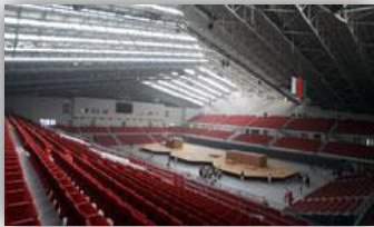
The China Agricultural University Gymnasium

The three following competition venues were selected, all former Olympic venues: