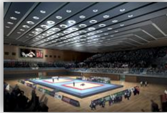
The Beijing Science and Technology University Gymnasium

Aikido, Sambo, Sumo & Wrestling Olympic venue for Wrestling