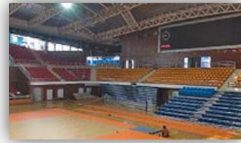
The Beijing Institute of Technology Gymnasium

Judo, Ju-Jitsu, Karate, Kendo & Taekwondo Olympic venue for Judo and Taekwondo